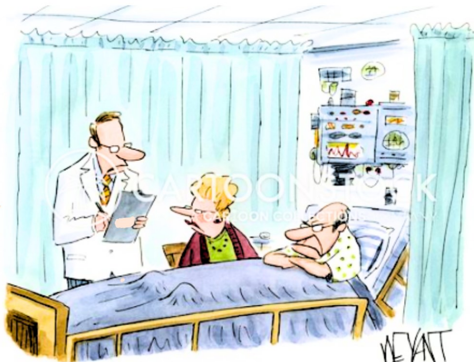
"He should be up and complaining in no time."